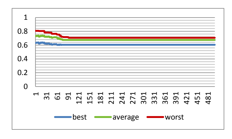
Figure 6. The GA progress toward the optimal design solution of Sustainable product design and manufacturing

As indicted in Figure 6, the GA converged to the optimal solution in 72 generations with the optimal design having a minimize fitness value 0.602647. This solution is considered the global optimum. The resulting values for decision variables and objective functions for this solution are presented in Table 3.