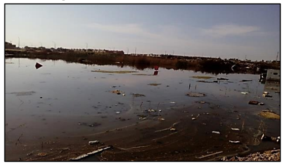
Figure 2. Areal picture of Site Area