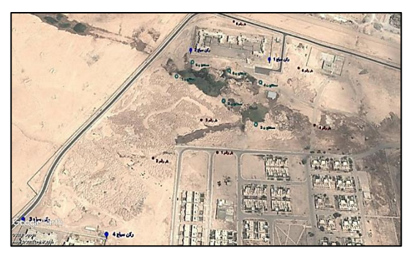
Figure 1. Areal Picture of Site Area

the location of the pond inside Al Anbar University from the north-west side near the Female Students' Compound, which is about 4,500 square meters.