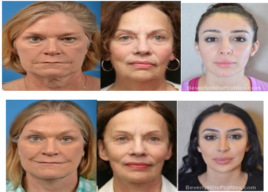
Figure1. Shows pictures of people before and after plastic surgery

whom the plastic facial surgery database is unavailable due to privacy concerns. Without access to surgery information, predicting static features (Areas without surgical effects) is very challenging. Cosmetic surgery may additionally be used for persons who attempt to conceal their identity to engage in or evade the law. The current face recognition algorithm effectively extracts a feature from an image. This procedure also makes it possible to steal freely without worrying about being recognized by a facial recognition system, which could result in the rejection of actual users. Fig. 1 shows an example of the effect of plastic surgery on facial appearance resulting from plastic surgery (before and after pictures of plastic surgery).