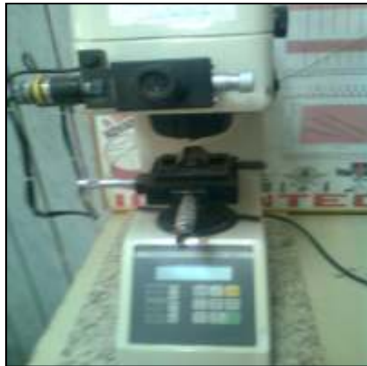
Figure (1): Digital micro hardness tester HVS-1000 (Germany).